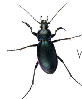
Violet ground beetle