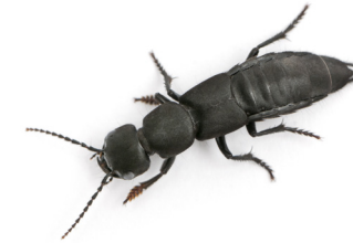
Devil's coach horse beetle